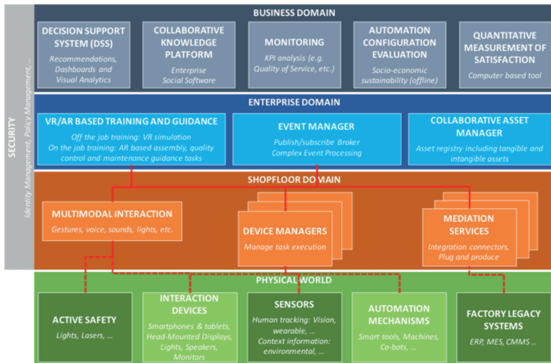
Figure 1: A4BLUE Functional & Modular Architecture

Business Layer is the upper layer and is in charge of supporting strategic decision-making process (sometimes using off-line tools), targeting both blue- and white-collar workers.